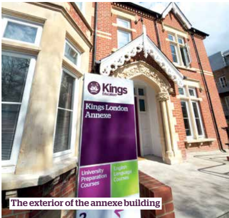
The exterior of the annexe building