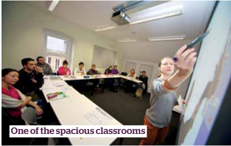
One of the spacious classrooms