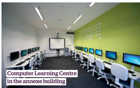
Computer Learning Centre in the annexe building