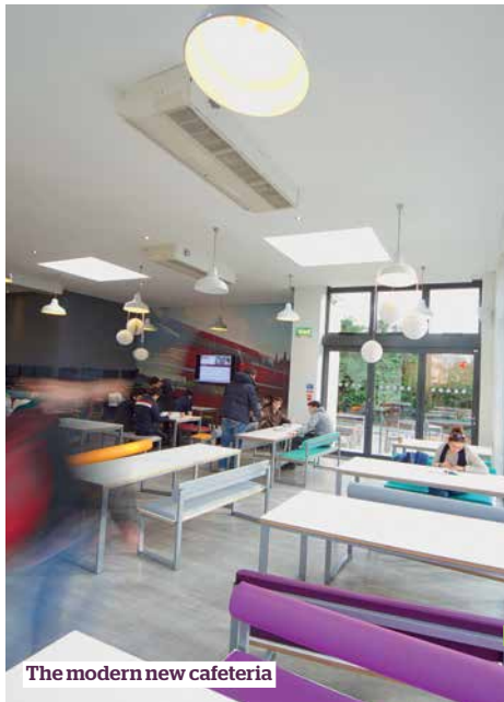
The modern new cafeteria