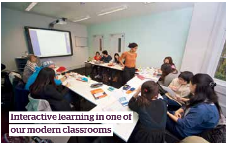
Interactive learning in one of our modern classrooms