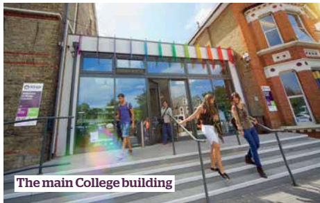
The main College building

Kings London is located in the safe, attractive suburb of Beckenham, only 20 minutes by train from Central London. The main College has been transformed by a modern 'link' building, which houses a new reception area and cafeteria, and connects the main teaching blocks. Our annexe building, two minutes' walk away, has a large, modern Computer Learning Centre and spacious classrooms with interactive whiteboards. Students also benefit from lovely College gardens, which can be accessed from the main cafeteria.