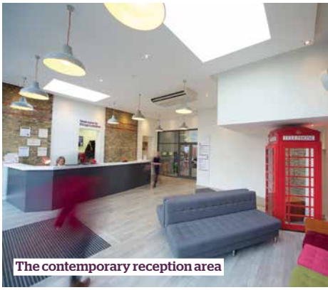
The contemporary reception area