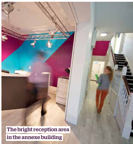
The bright reception area in the annexe building

Kings London is located in the safe, attractive suburb of Beckenham, only 20 minutes by train from Central London. The main College has been transformed by a modern 'link' building, which houses a new reception area and cafeteria, and connects the main teaching blocks. Our annexe building, two minutes' walk away, has a large, modern Computer Learning Centre and spacious classrooms with interactive whiteboards. Students also benefit from lovely College gardens, which can be accessed from the main cafeteria.